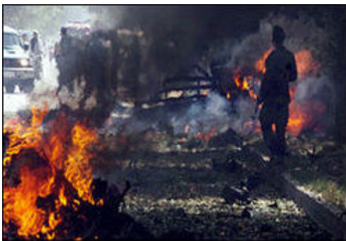
Indian Embassy in Kabul

On July 7, 2008, a bomb exploded at the Indian embassy in Kabul, Afghanistan, killing over 50 people, and injuring over 100 others. The Afghan government and the Indian intelligence agency immediately blamed the ISI, in collaboration with the Taliban and Al-Qaeda, of planning and executing the attack. Reports on the bombing suggested that the aim was to “increase the distrust between Pakistan and Afghanistan and undermine Pakistan's relations with India, despite recent signs that a peace process between Islamabad and New Delhi was making some headway.”