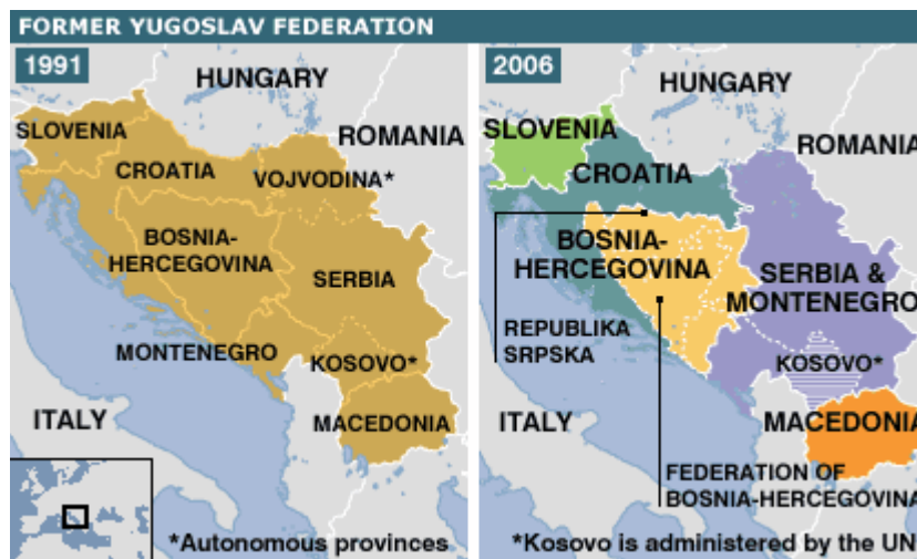
Yugoslavia - Before and After Balkanization

In 1992, with the start of the Bosnian War, Al-Qaeda-affiliated terrorists began operating with the ethnic Bosnian Muslim minority in fighting the Serbs. In turn, these Al-Qaeda affiliated groups were supported with training, arming, and finances by German, Turkish, Iranian and US intelligence agencies; with additional financial support from Saudi Arabia. In 1997, the Kosovo War began, in which the militant-terrorist-drug trafficking Kosovo Liberation Army (KLA) began fighting against Serbia, with training, arms and financial support from the US and other NATO countries. The CIA, German intelligence, the DIA, MI6 and British Special Forces (SAS) all provided training and support to the KLA.