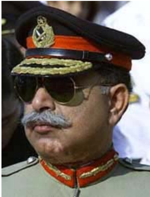
ISI Chief Lt.-General Mahmoud Ahmad

Of significance is that this ISI Chief, Lt.-General Mahmoud Ahmad, was approved as head of the ISI by the US in 1999. From then, he was in close contact and liaison with top officials of the CIA, the Defense Intelligence Agency (DIA), and the Pentagon. [See: Michel Chossudovsky, Cover-up or Complicity of the Bush Administration? Global Research: November 2, 2001 ]